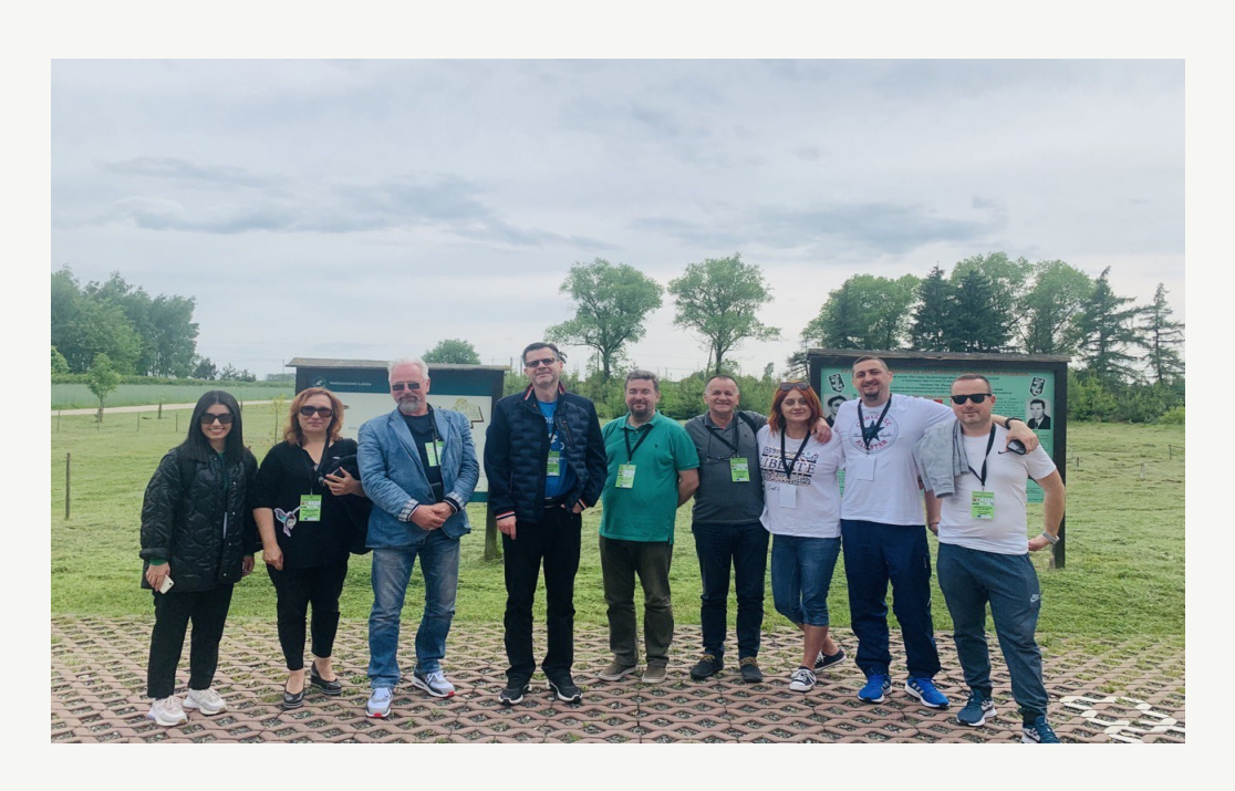
We would like to thank Erasmus+ Program to give us this opportunity.